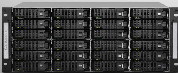
24 3.5" Bays, 4U

Increase capacity of the iSAN V 2108L series, as needed, to over 2 PB with up to 2 expansion cabinets.