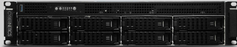
iSAN® V 2108L Series