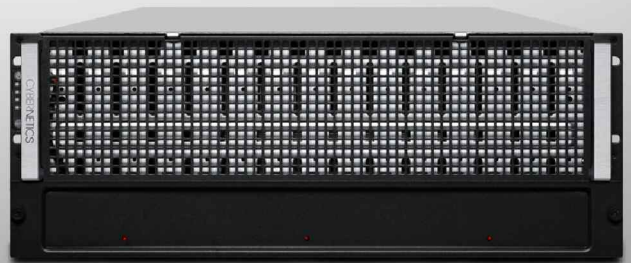
60 3.5" Bays, 4U